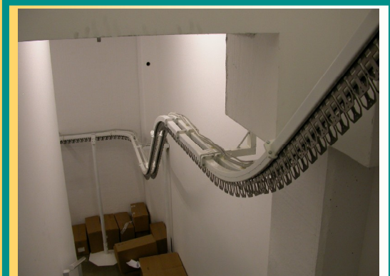
Magazzini confezioni Stock house